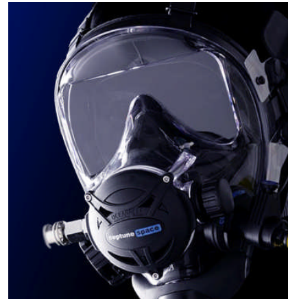
nasal mask, making it the ALL BLACK MASK.

The Raptor is a fully oxygen clean Space mask. The o-rings are made by Viton and the o-rings lubricant is a Christolube Oxigen Grease. The mask can also be used with conventional air as well. The Raptor distinguishes itself by the black Ixef® polyamide cover and the black ori-