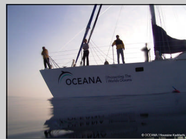
Oceana's research catamaran, Ranger

If you would like to learn more about Oceana and their conservation efforts, visit www.oceana.org .