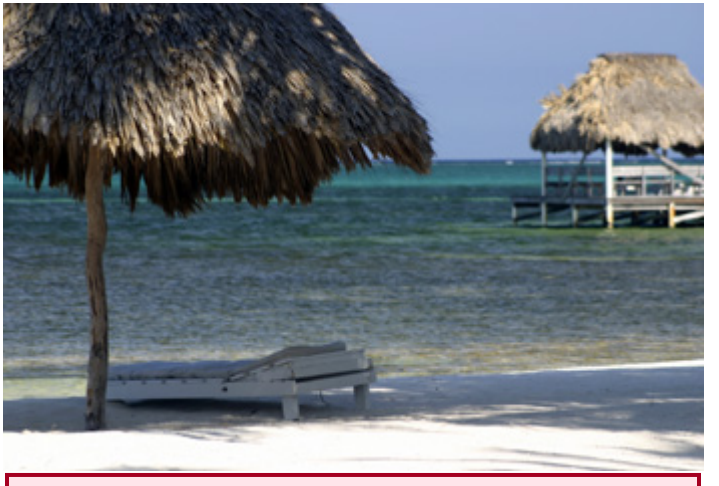
Ambergris Caye in Belize.

rain fall per month. The dry season is shorter in the south, normally only lasting from February to April. A shorter, less rainy period, known locally as the "little dry," usually occurs in late July or August, after the initial onset of the rainy season. Hurricanes have played key--and devastating-roles in Belizean history. In 1931 an unnamed hurricane destroyed over two-thirds of the buildings in Belize City and killed more than 1,000 people. In 1955 Hurricane Janet leveled the northern town of Corozal. Only six years later, Hurricane Hattie struck the central coastal area of the country, with winds in excess of 300 kilometers per hour and four-meter storm tides. The devastation of Belize City for the second time in 30 years prompted the relocation of the capital some 80 kilometers inland to the planned city of Belmopan. The most recent hurricane to devastate Belize was Hurricane Greta, which caused more than US$25 million in damages along the southern coast in 1978.